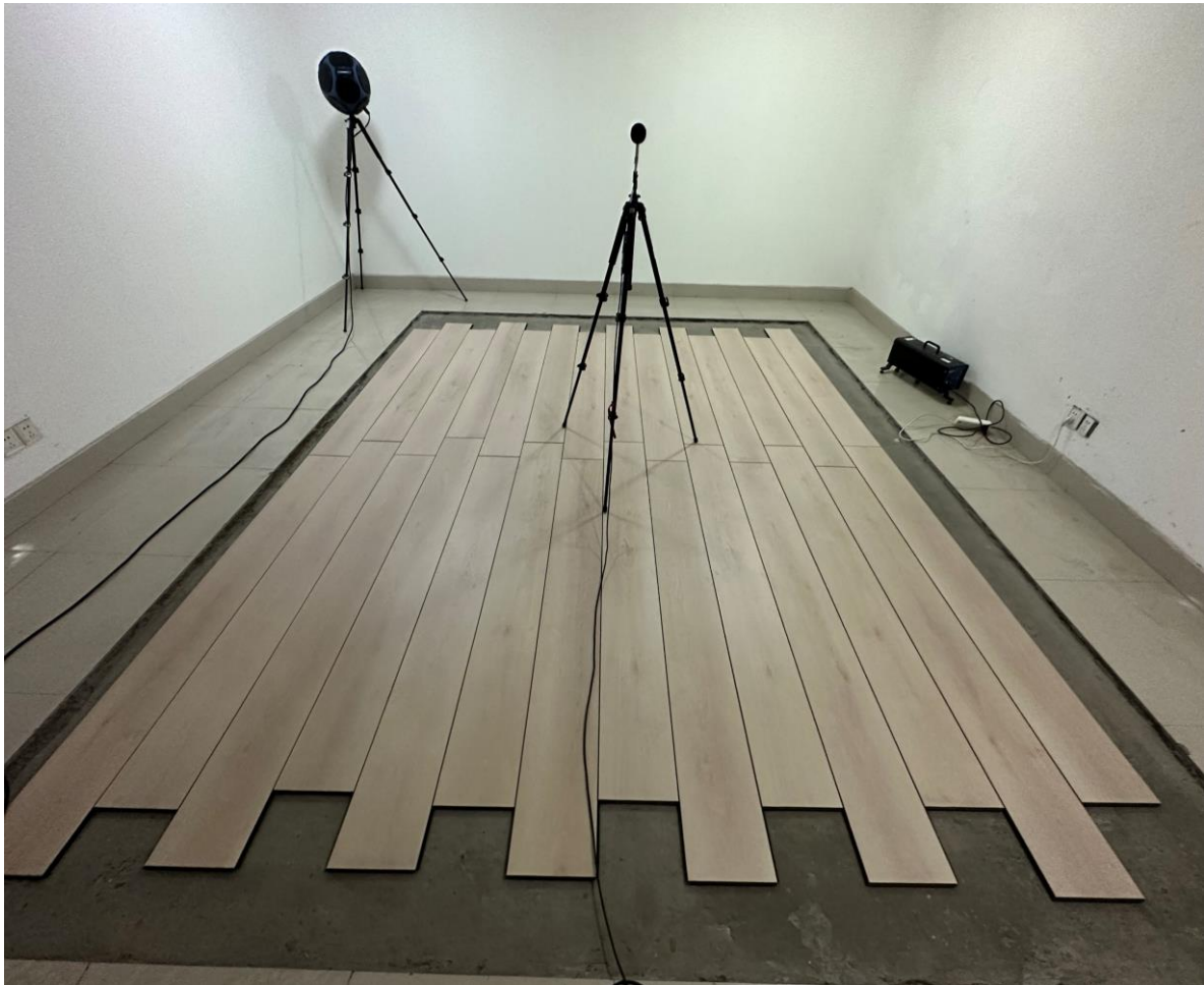
Test set up